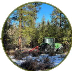
Mowing & Mastication