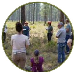
National Environmental Policy Act (NEPA) Planning